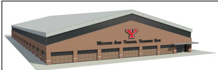
WATSON AND TRESSEL TRAINING SITE